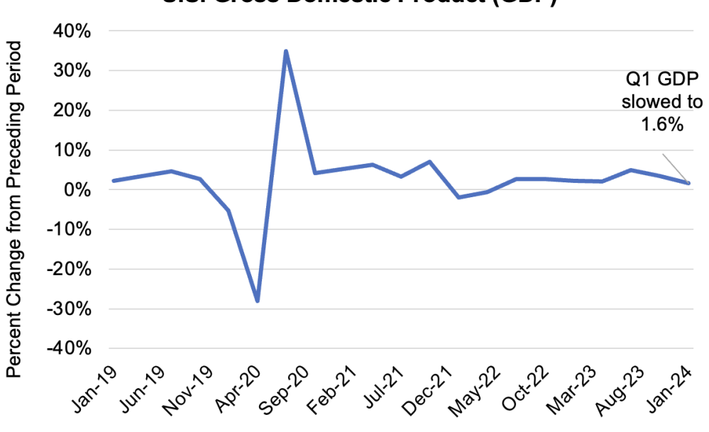
U.S. Gross Domestic Product (GDP)